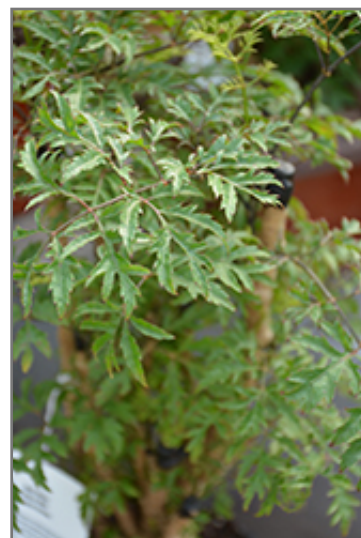
Ming Aralia foliage