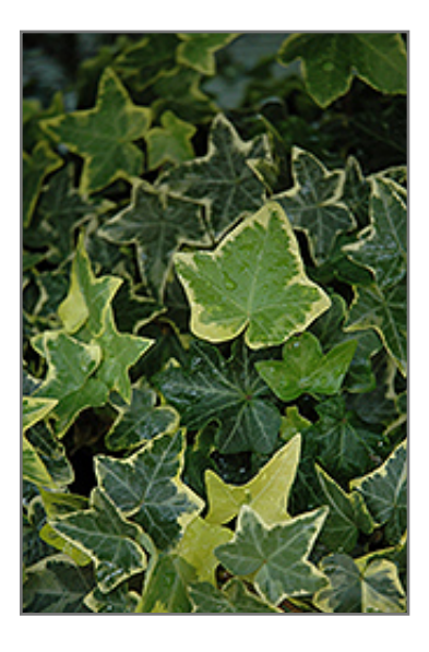
Gold Child Ivy foliage

When grown indoors, Gold Child Ivy can be expected to grow to be about 10 feet tall at maturity, with a spread of 3 feet. It grows at a medium rate, and under ideal conditions can be expected to live for approximately 30 years. This houseplant performs well in both bright or indirect sunlight and strong artificial light, and can therefore be situated in almost any well-lit room or location. It prefers to grow in average to moist soil. The surface of the soil shouldn't be allowed to dry out completely, and so you should expect to water this plant once and possibly even twice each week. Be aware that your particular watering schedule may vary depending on its location in the room, the pot size, plant size and other conditions; if in doubt, ask one of our experts in the store for advice. It is not particular as to soil pH, but grows best in rich soil. Contact the store for specific recommendations on pre-mixed potting soil for this plant. Be warned that parts of this plant are known to be toxic to humans and animals, so special care should be exercised if growing it around children and pets.