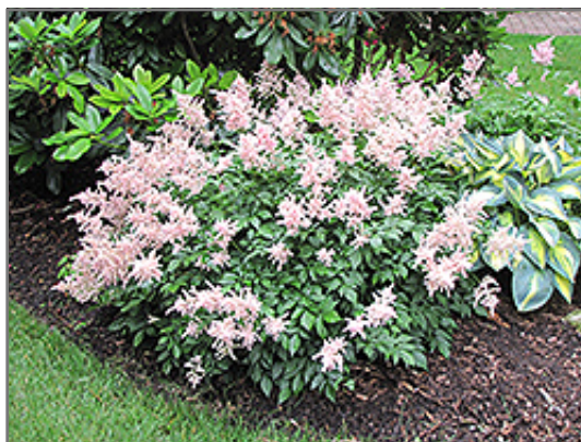
Peach Blossom Astilbe in bloom