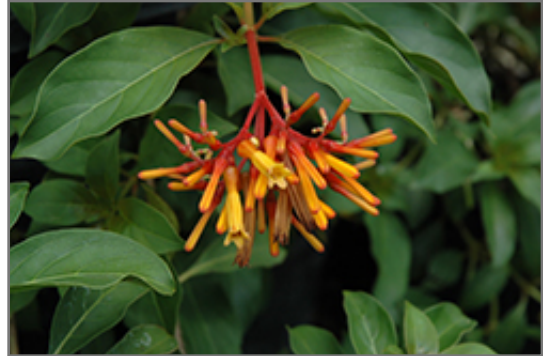
Dwarf Firebush flowers