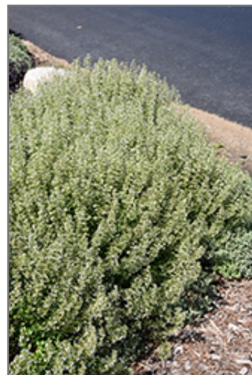
White Cloud Dwarf Calamint in bloom