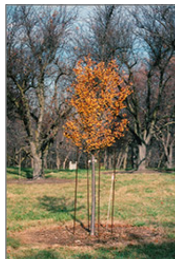
Lancelot Flowering Crab fruit