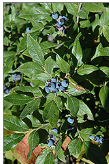
Lowbush Blueberry fruit

Lowbush Blueberry features dainty clusters of white bell-shaped flowers with shell pink overtones hanging below the branches in mid spring. It has dark green deciduous foliage. The oval leaves turn an outstanding scarlet in the fall. It features an abundance of magnificent blue berries in mid summer.