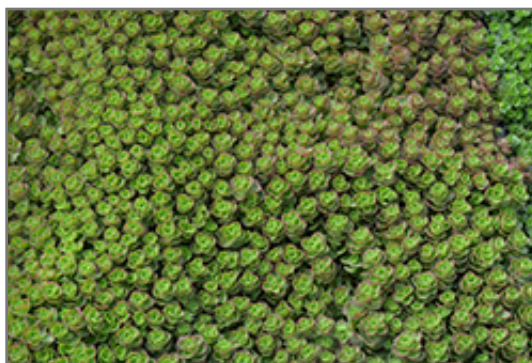
Dragon's Blood Stonecrop foliage