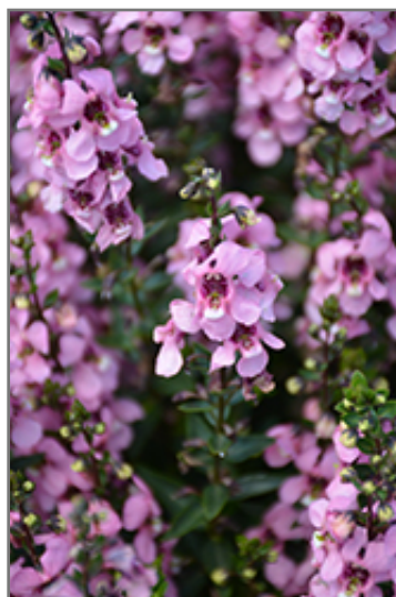
Serenita Pink Angelonia flowers