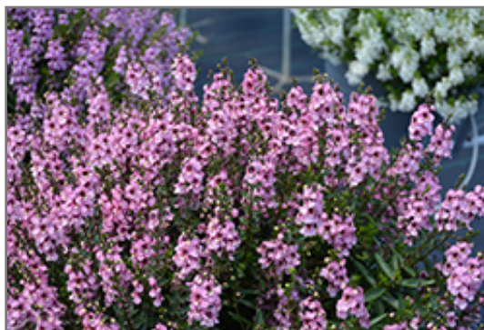
Serenita Pink Angelonia in bloom