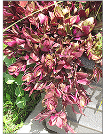
Purple Wandering Jew

Purple Wandering Jew is recommended for the following landscape applications;