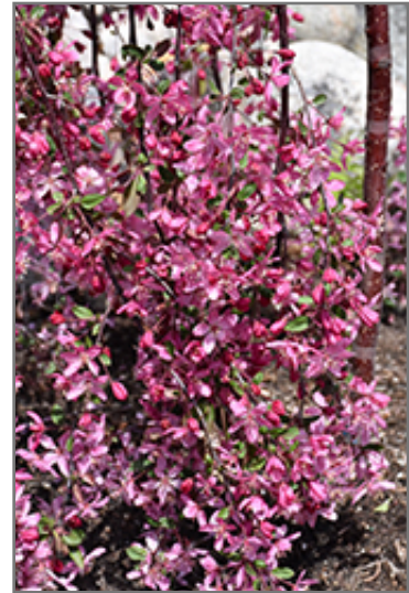
Royal Beauty Flowering Crab flowers