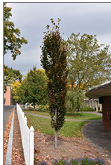
Dawyck Purple Beech