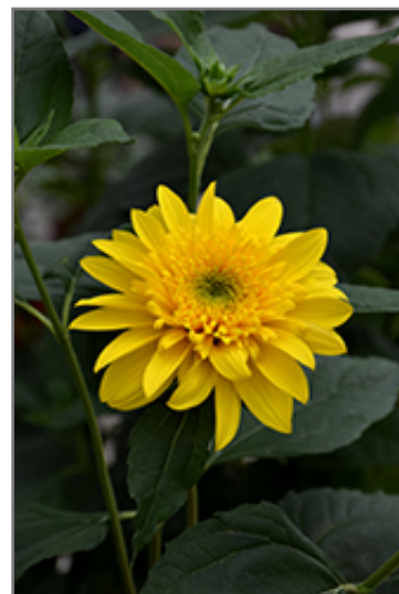
Happy Days Sunflower flowers

Happy Days Sunflower is recommended for the following landscape applications;