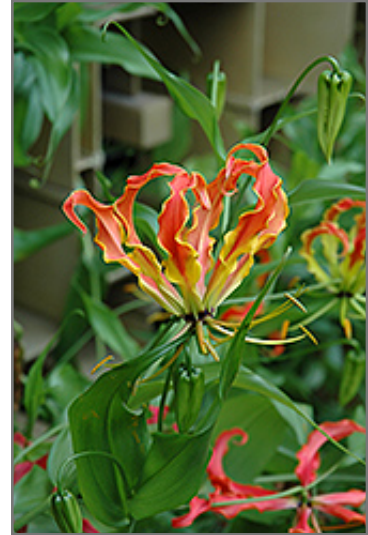
Gloriosa Lily flowers

Gloriosa Lily is recommended for the following landscape applications;