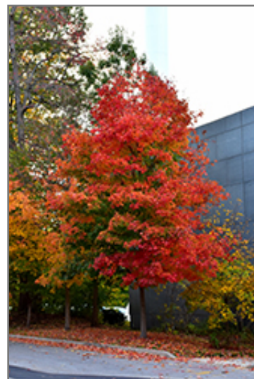
Fall Fiesta Sugar Maple in fall