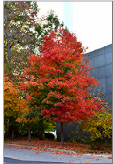
Fall Fiesta Sugar Maple in fall