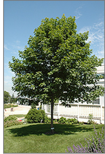
Fall Fiesta Sugar Maple

* This is a 'special order' plant - contact store for details