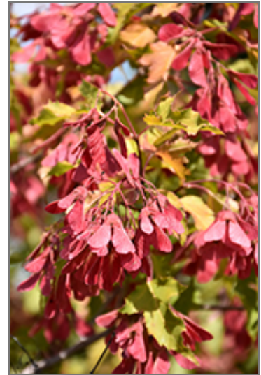
Amur Maple (tree form) fruit

* This is a 'special order' plant - contact store for details