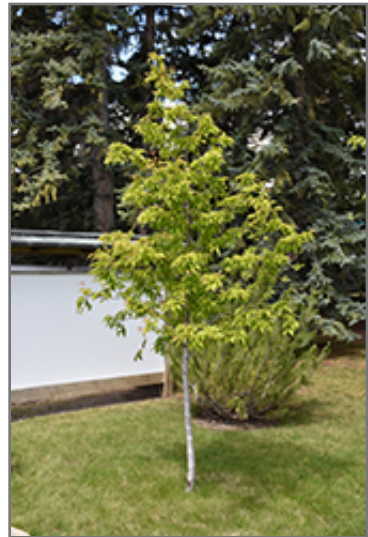
Amur Maple (tree form)