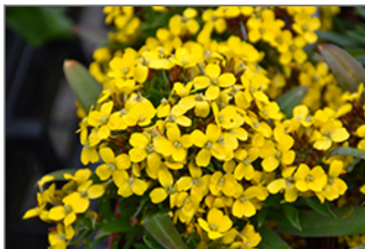
Canaries Wallflower flowers