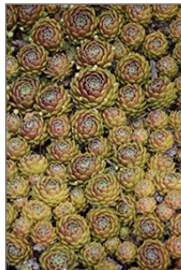
Piliosium Hens And Chicks