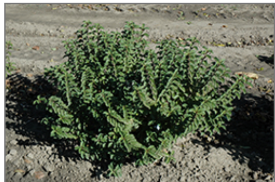
Pucker Up Red Twig Dogwood