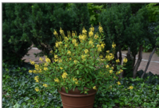
Thryallis in bloom