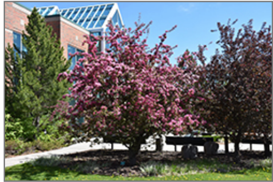
Makamik Flowering Crab in bloom

Makamik Flowering Crab is recommended for the following landscape applications;