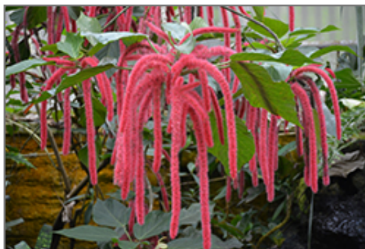
Firetail Chenille Plant flowers