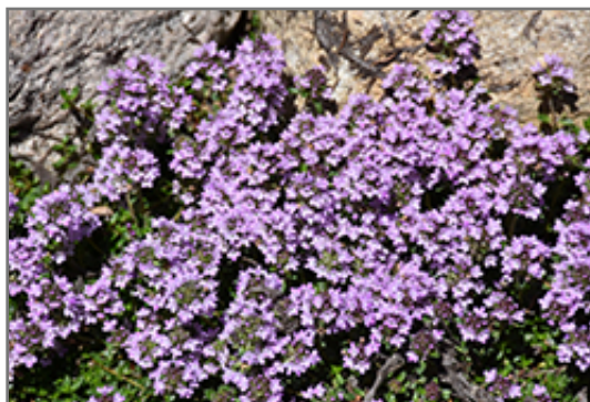
Purple Carpet Creeping Thyme flowers

This plant will require occasional maintenance and upkeep, and is best cleaned up in early spring before it resumes active growth for the season. Deer don't particularly care for this plant and will usually leave it alone in favor of tastier treats. Gardeners should be aware of the following characteristic(s) that may warrant special consideration;