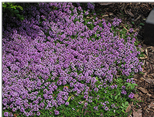
Purple Carpet Creeping Thyme in bloom