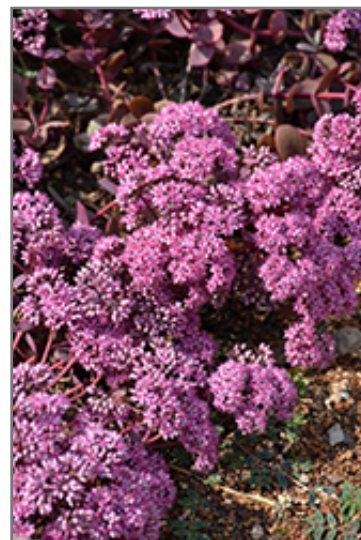
Cherry Tart Stonecrop flowers

Cherry Tart Stonecrop is a fine choice for the garden, but it is also a good selection for planting in outdoor pots and containers. It is often used as a 'filler' in the 'spiller-thriller-filler' container combination, providing a mass of flowers and foliage against which the larger thriller plants stand out. Note that when growing plants in outdoor containers and baskets, they may require more frequent waterings than they would in the yard or garden. Be aware that in our climate, most plants cannot be expected to survive the winter if left in containers outdoors, and this plant is no exception. Contact our experts for more information on how to protect it over the winter months.