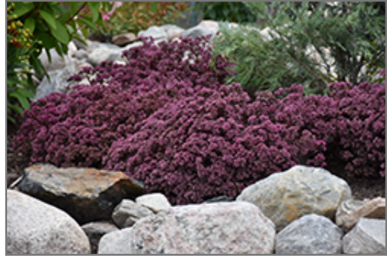
Cherry Tart Stonecrop in bloom

Cherry Tart Stonecrop is a dense herbaceous perennial with an upright spreading habit of growth. Its medium texture blends into the garden, but can always be balanced by a couple of finer or coarser plants for an effective composition.