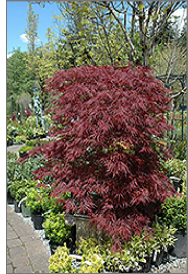
Red Dragon Japanese Maple

This plant is not reliably hardy in our region, and certain restrictions may apply; contact the store for more information.