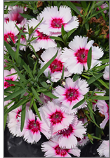
Super Parfait Raspberry Pinks flowers

Super Parfait Raspberry Pinks is a fine choice for the garden, but it is also a good selection for planting in outdoor pots and containers. It is often used as a 'filler' in the 'spiller-thriller-filler' container combination, providing a mass of flowers and foliage against which the thriller plants stand out. Note that when growing plants in outdoor containers and baskets, they may require more frequent waterings than they would in the yard or garden. Be aware that in our climate, most plants cannot be expected to survive the winter if left in containers outdoors, and this plant is no exception. Contact our experts for more information on how to protect it over the winter months.