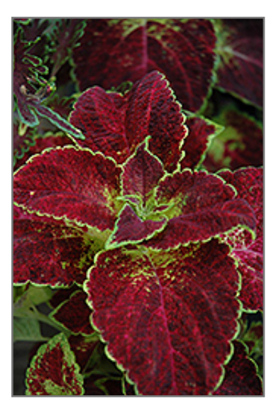
ColorBlaze Dipt in Wine Coleus foliage