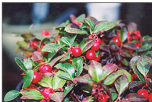
Creeping Wintergreen fruit