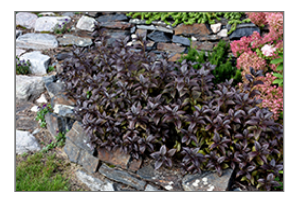
Tango Weigela

This shrub should only be grown in full sunlight. It prefers to grow in average to moist conditions, and shouldn't be allowed to dry out. It is not particular as to soil type or pH. It is highly tolerant of urban pollution and will even thrive in inner city environments. This is a selected variety of a species not originally from North America.