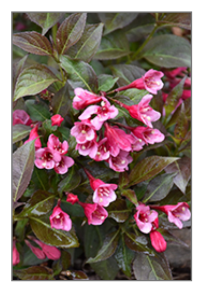
Tango Weigela flowers