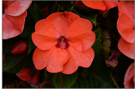
SunPatiens Compact Hot Coral New Guinea Impatiens flowers

This plant will require occasional maintenance and upkeep, and should not require much pruning, except when necessary, such as to remove dieback. It is a good choice for attracting bees and butterflies to your yard. It has no significant negative characteristics.