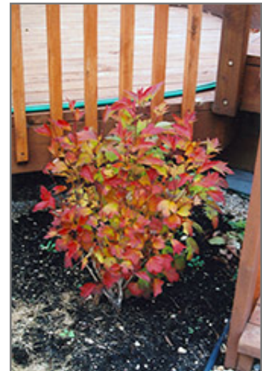
Compact Highbush Cranberry in fall