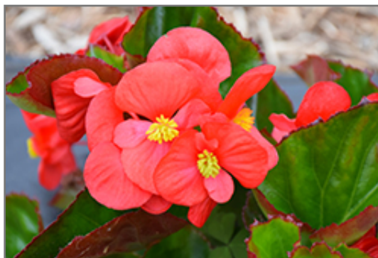
Big Red Green Leaf Begonia flowers

This is a high maintenance plant that will require regular care and upkeep, and usually looks its best without pruning, although it will tolerate pruning. Deer don't particularly care for this plant and will usually leave it alone in favor of tastier treats. Gardeners should be aware of the following characteristic(s) that may warrant special consideration;