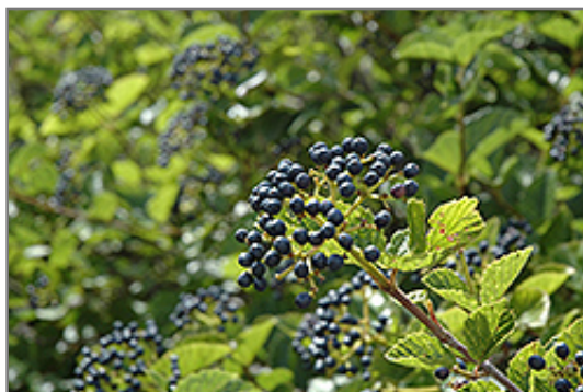
Chicago Lustre Viburnum fruit