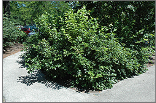
Chicago Lustre Viburnum

Chicago Lustre Viburnum will grow to be about 10 feet tall at maturity, with a spread of 10 feet. It tends to be a little leggy, with a typical clearance of 2 feet from the ground, and is suitable for planting under power lines. It grows at a medium rate, and under ideal conditions can be expected to live for 40 years or more.