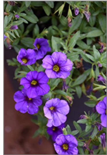
Aloha Kona Midnight Blue Calibrachoa flowers

Aloha Kona Midnight Blue Calibrachoa is recommended for the following landscape applications;