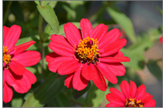
Profusion Double Hot Cherry Zinnia flowers

Profusion Double Hot Cherry Zinnia is recommended for the following landscape applications;