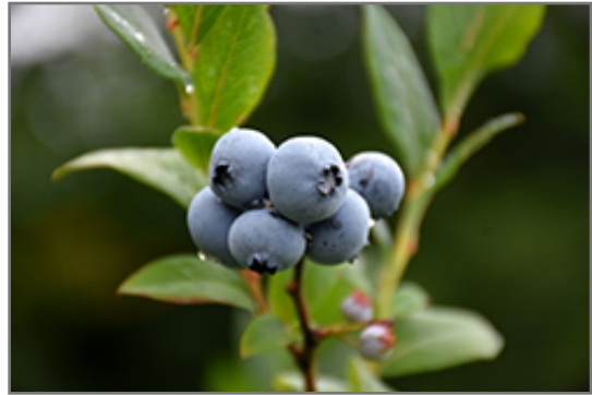
Northsky Blueberry fruit

Northsky Blueberry features dainty clusters of white bell-shaped flowers with shell pink overtones hanging below the branches in mid spring. It has green deciduous foliage. The glossy oval leaves turn an outstanding scarlet in the fall. It features an abundance of magnificent blue berries in mid summer.