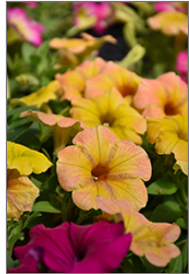
Cascadias Indian Summer Petunia flowers

Cascadias Indian Summer Petunia is recommended for the following landscape applications;