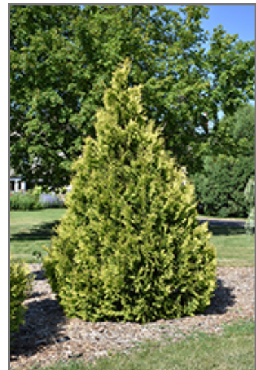
Yellow Ribbon Arborvitae