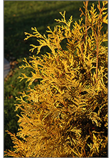
Yellow Ribbon Arborvitae in fall

* This is a 'special order' plant - contact store for details