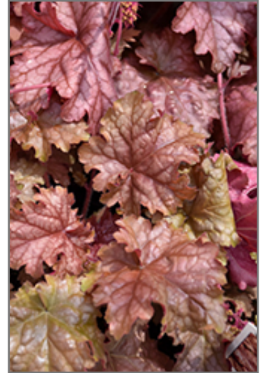
Carnival Peach Parfait Coral Bells foliage

Carnival Peach Parfait Coral Bells is recommended for the following landscape applications;