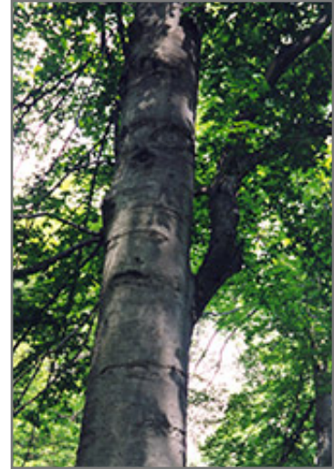
American Beech bark

* This is a 'special order' plant - contact store for details