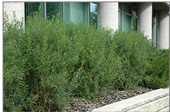
Dwarf Turkestan Burning Bush