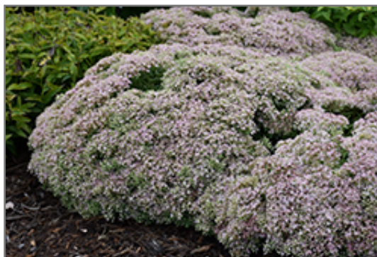
Rock 'N Round Pure Joy Stonecrop in bloom

This is a relatively low maintenance plant, and is best cleaned up in early spring before it resumes active growth for the season. It is a good choice for attracting bees and butterflies to your yard, but is not particularly attractive to deer who tend to leave it alone in favor of tastier treats. It has no significant negative characteristics.