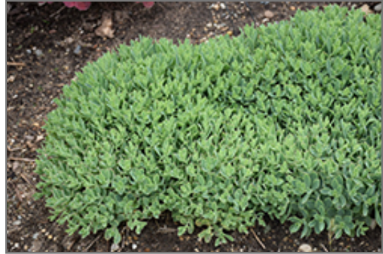
Rock 'N Round Pure Joy Stonecrop

Rock 'N Round Pure Joy Stonecrop will grow to be about 10 inches tall at maturity, with a spread of 15 inches. When grown in masses or used as a bedding plant, individual plants should be spaced approximately 12 inches apart. Its foliage tends to remain low and dense right to the ground. It grows at a fast rate, and under ideal conditions can be expected to live for approximately 15 years. As an herbaceous perennial, this plant will usually die back to the crown each winter, and will regrow from the base each spring. Be careful not to disturb the crown in late winter when it may not be readily seen!