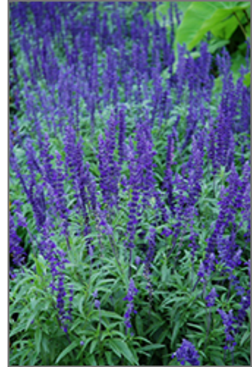
Victoria Blue Salvia flowers

Victoria Blue Salvia is a fine choice for the garden, but it is also a good selection for planting in outdoor pots and containers. With its upright habit of growth, it is best suited for use as a 'thriller' in the 'spiller-thriller-filler' container combination; plant it near the center of the pot, surrounded by smaller plants and those that spill over the edges. Note that when growing plants in outdoor containers and baskets, they may require more frequent waterings than they would in the yard or garden.