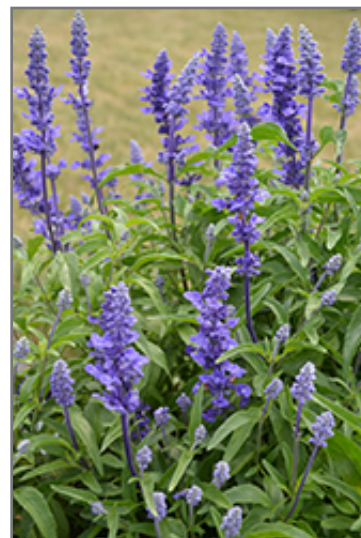
Victoria Blue Salvia flowers

Victoria Blue Salvia is recommended for the following landscape applications;