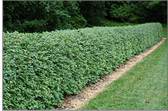
Winged Burning Bush

This shrub performs well in both full sun and full shade. It is very adaptable to both dry and moist locations, and should do just fine under average home landscape conditions. It is not particular as to soil type or pH. It is highly tolerant of urban pollution and will even thrive in inner city environments. This species is not originally from North America.