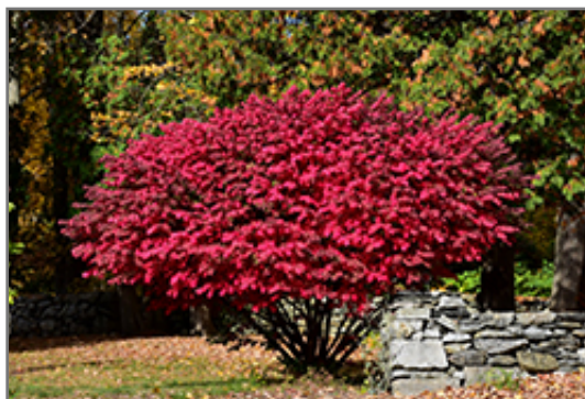
Winged Burning Bush in fall

Winged Burning Bush is recommended for the following landscape applications;