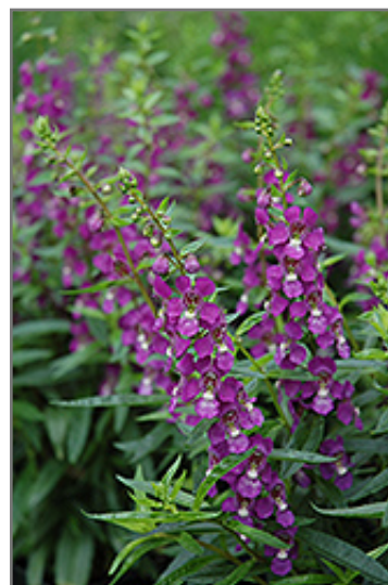
Serenita Purple Angelonia flowers