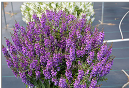
Serenita Purple Angelonia in bloom