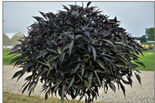
Illusion Midnight Lace Sweet Potato Vine