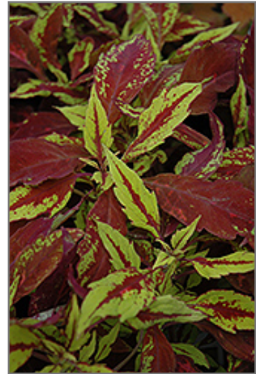
Pineapple Coleus foliage