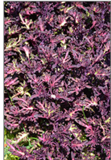
Merlin's Magic Coleus foliage