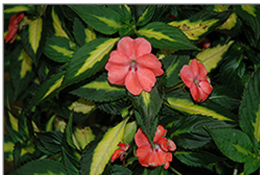
SunPatiens Spreading Variegated Salmon New Guinea Impatiens flowers