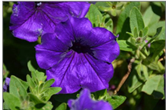
Easy Wave Blue Petunia flowers